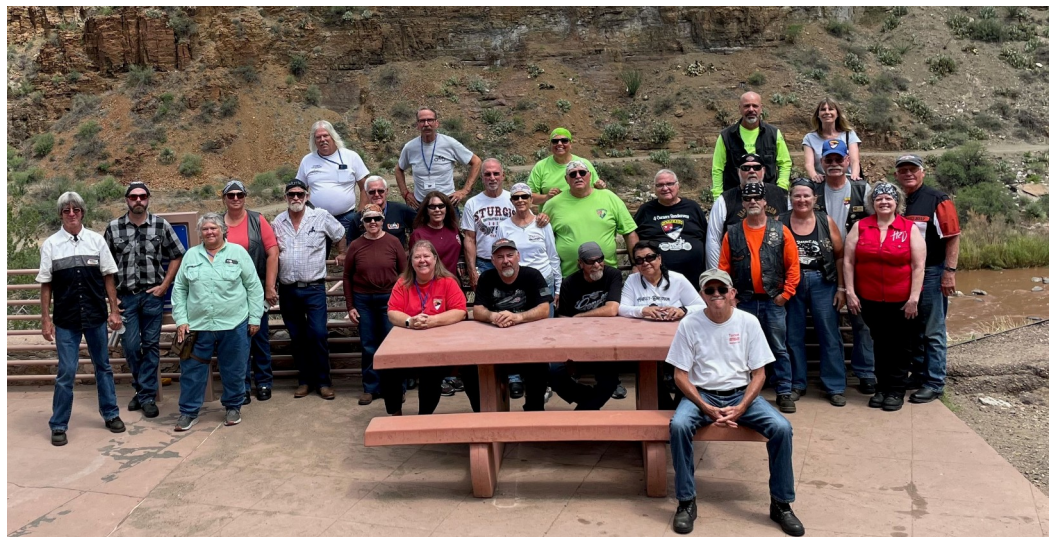
Ride to Salt River Canyon overlook