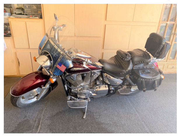
2007 Honda VTX 1300