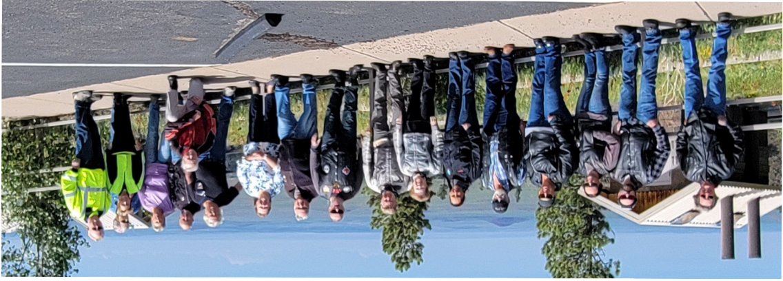
Some pictures from Four Corner's Rally