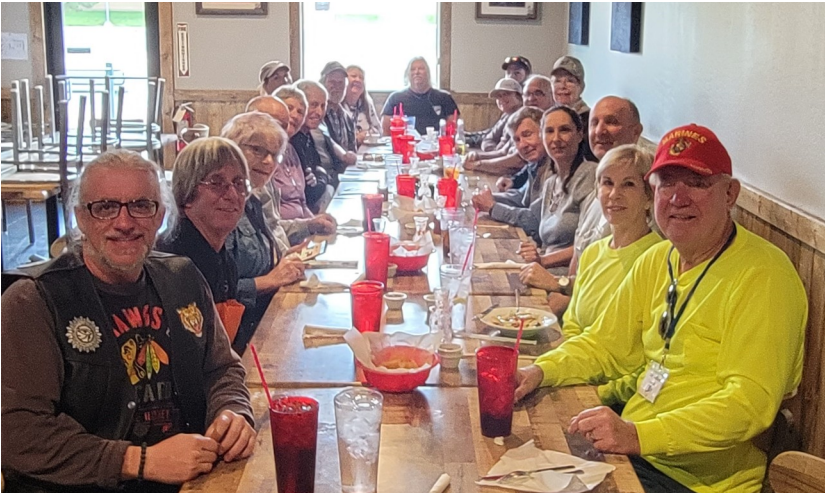
Picture from Four Corner's Rally