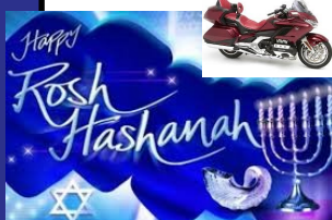
Sept 10 Rosh Hashanah