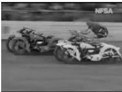
Then they added more bikes.

The information on this rare sport is sparse, the dare devil trend started catching on in the early 1920s.