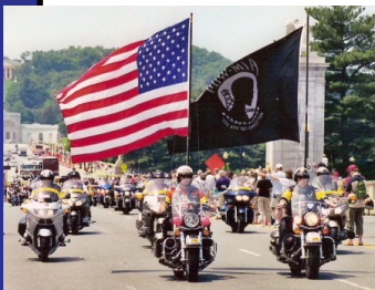
Sept. 15 MIA/POW