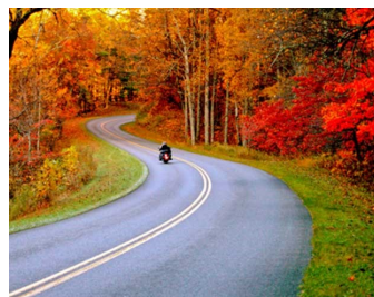
Sept . 22 First Day Of Autumn

Please go to www.americanmotorcycleassociation.com then read to "For Partners" then then to "Resources and Forms". Scroll down to "Risk Management Videos", watch and download waivers that are necessary for any people working on an AMA sanctioned event.